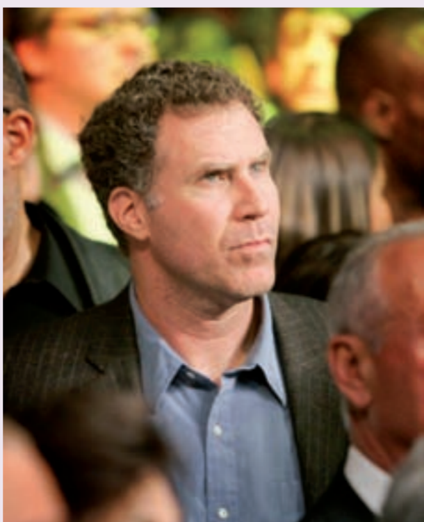
FILE - Actor Will Ferrell.

Eddie Murphy commanded a high salary after the success of family comedies like The Nutty Professor . But his most recent films Meet Dave and Imagine That were box office duds, taking Murphy to fourth place for earning an average $4.43 for each dollar he was paid, Forbes.com said.