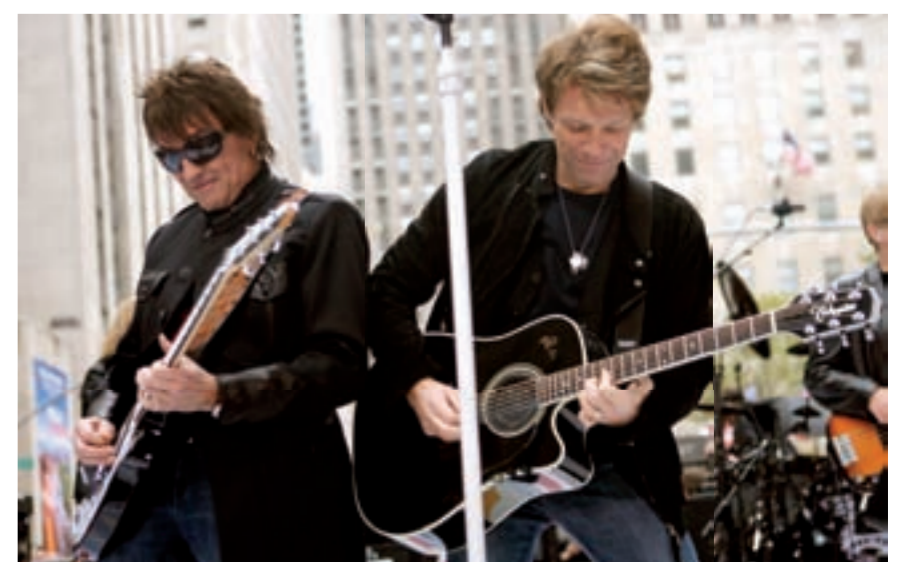
FILE - Guitarist Richie Sambora, (left) and singer Jon Bon Jovi perform with Bon Jovi on NBC's 'Today' in New York's Rockefeller Center Wednesday, Nov. 11.

Overall album sales totaled 7.04 million units, up 3 percent compared to the sum during the previous week, but down 21 percent compared to the same sales week of 2008. Year-to-date album sales stand at 301.5 million, down 13 percent compared to the same total at this point last year. -Reuters