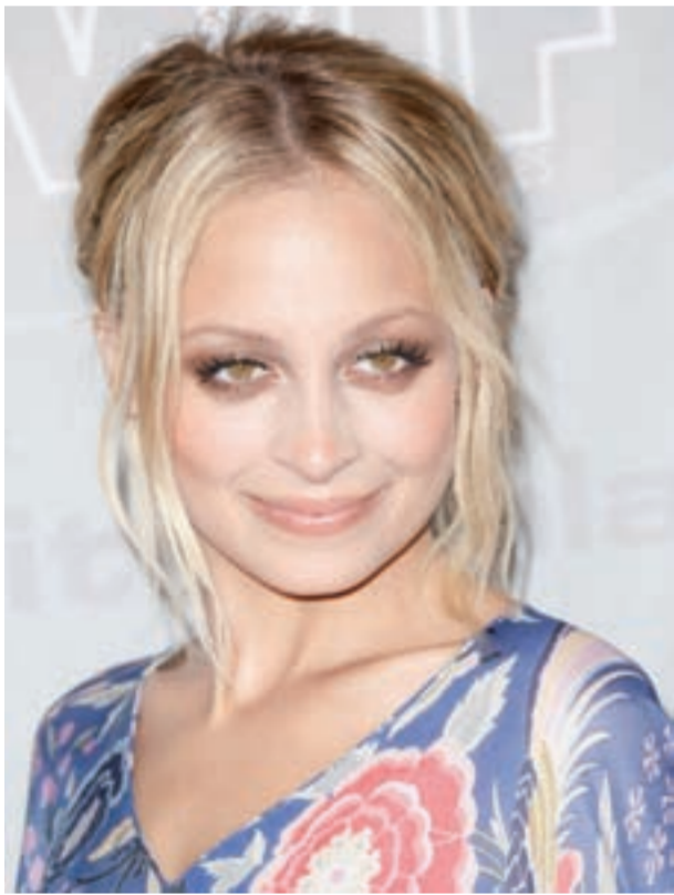
FILE - Nicole Richie.

LOS ANGELES: Nicole Richie has been admitted to a Los Angeles hospital and is being treated for pneumonia. Her representative says she's doing well.